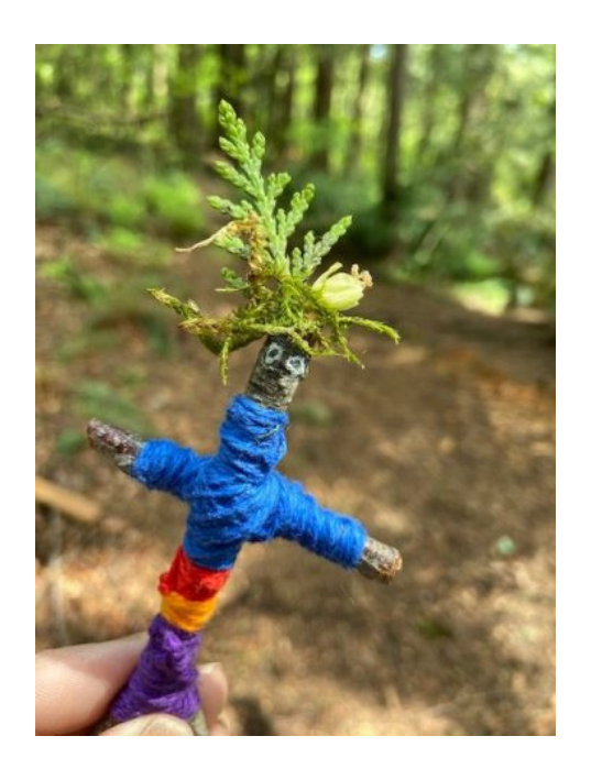
Ricky's and Vicki's Adventures