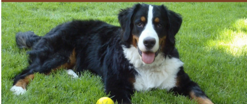
FACT: The Bernese Mountain Dog is a large-sized breed of dog, one of the four breeds of Sennenhund-type dogs from the Swiss Alps.