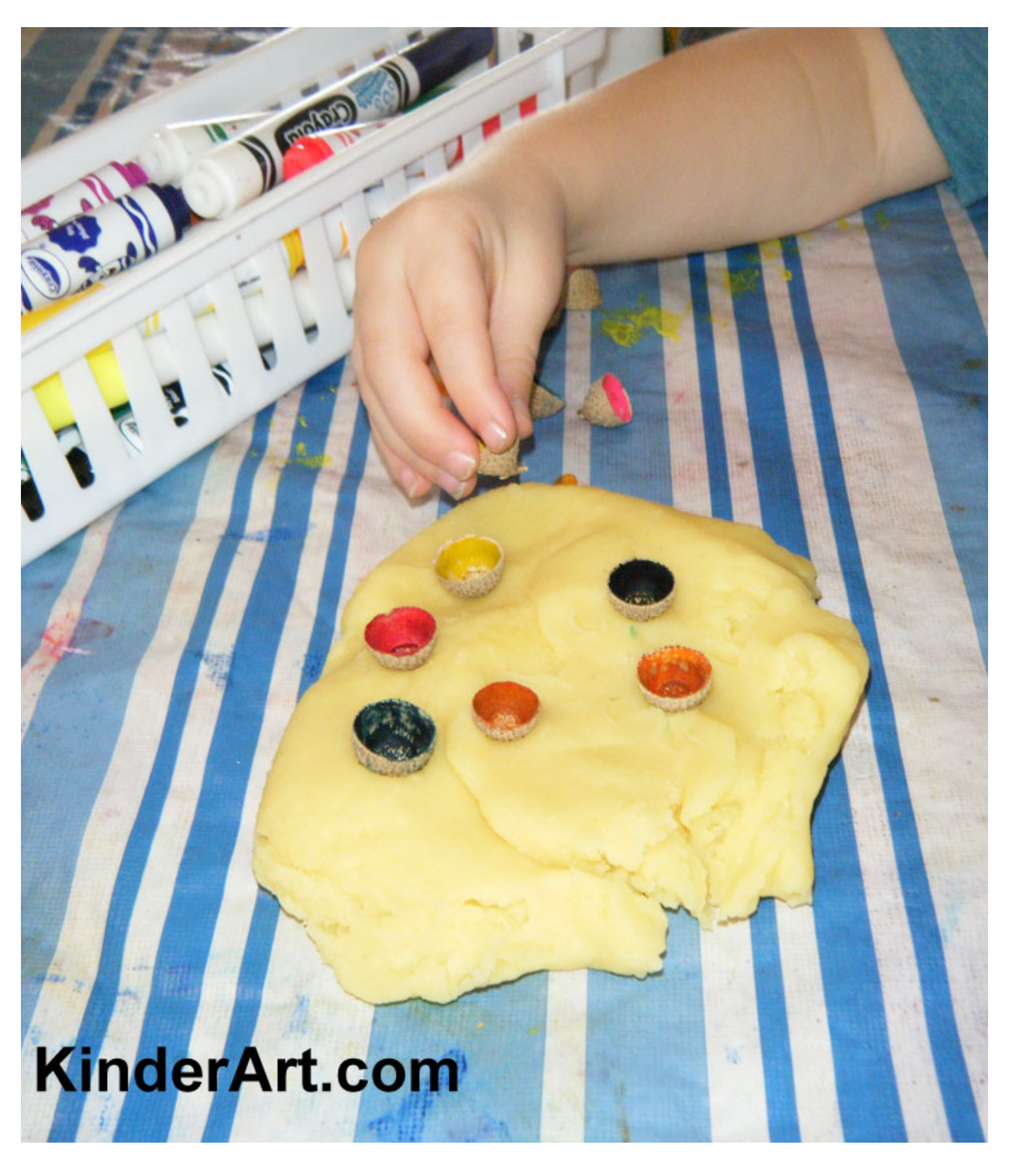
Next, start filling each acorn cap with glue. Remember to use school glue – the kind that dries clear. Fill them to the top.