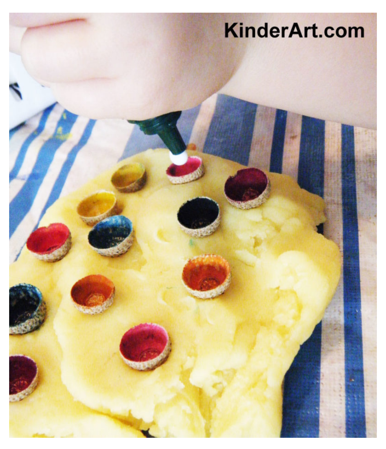
Find a warm place for the glue-filled acorn caps to dry. Set aside for up to 48 hours. Wait. This is the hardest part.