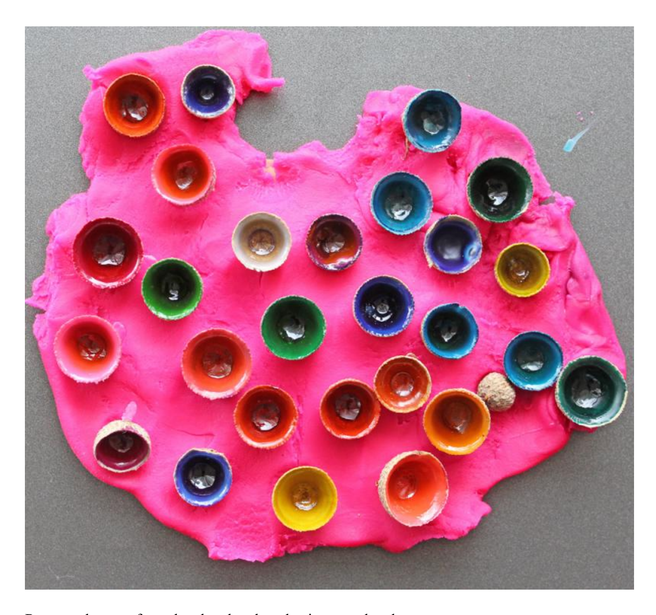
Remove the caps from the play dough and enjoy your lovely nature gems.