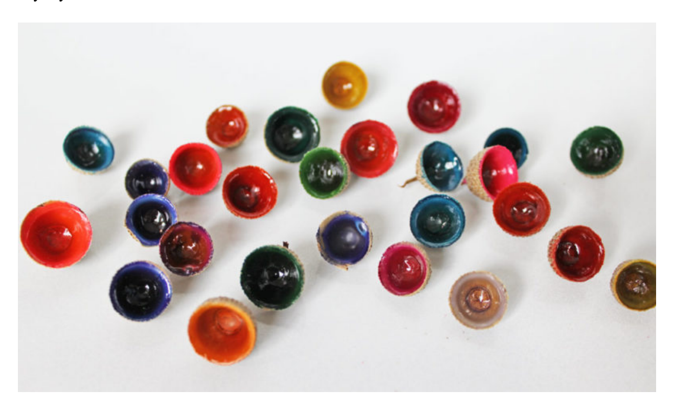
Tip: We used Elmer's School glue to fill the caps because it flows really well, but when dry, we added a thin coat of Crayola 3-D glue. This final layer gave the acorn gems a nice shiny finish. Mod Podge would probably work well as a finishing coat as well.