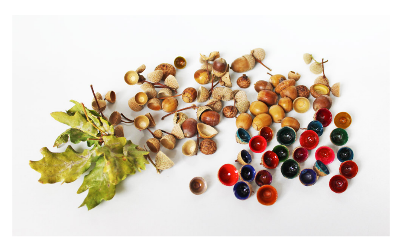
Try it yourself and let us know how it turns out.