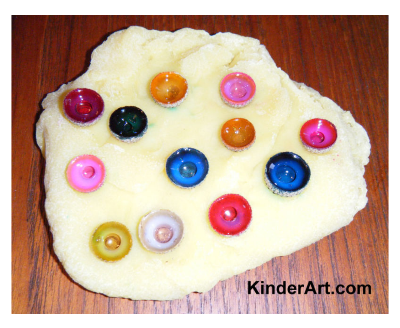
You will know they are ready when the glue is completely clear. (Yes, this is a different batch, hence the pink play doh).