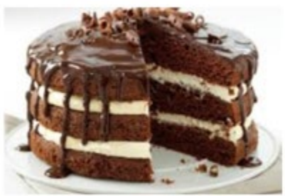
Final product, cake.