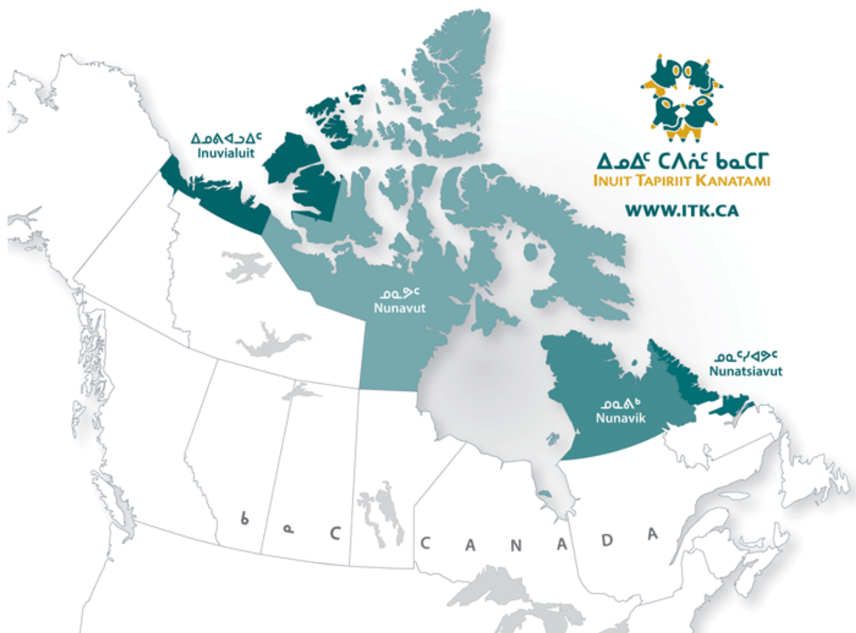
Figure 1: Map of the Nunavut and Nunavik Regions

Look at the map above. Can you point to where you live?