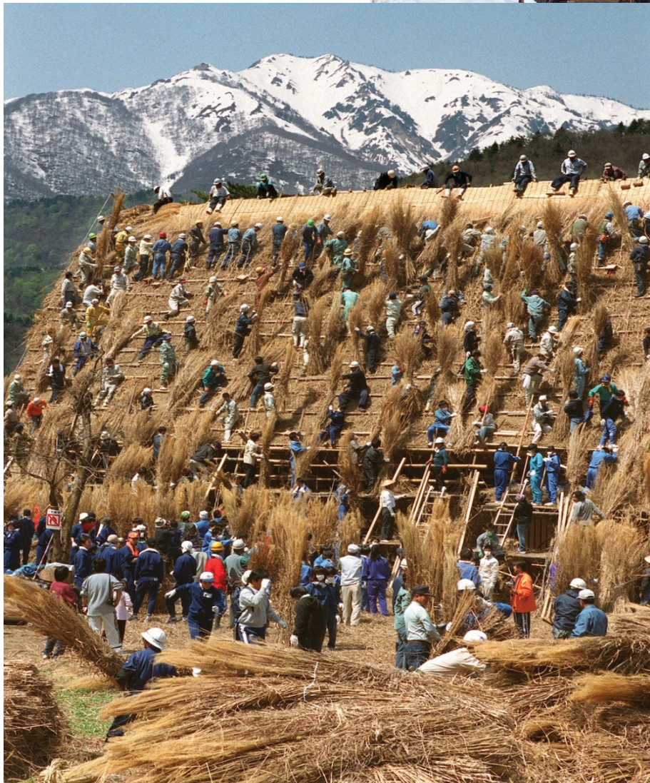
Figure 2: Community project