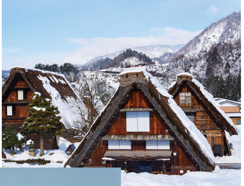
Figure 1: Completed home in Shirakawa-go, Japan