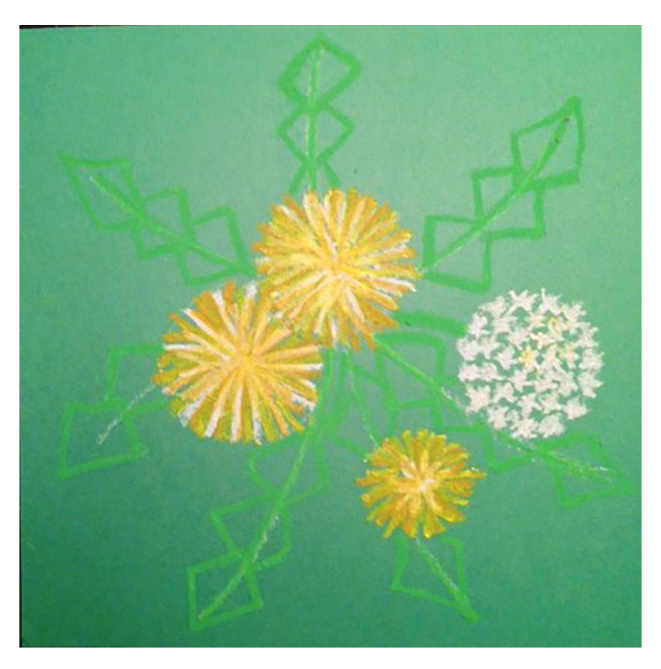
Fill in the centres of the leaves with a darker green. Go over the stems once again with light green. Meanwhile, you can add any final details to the flower heads and puff balls.