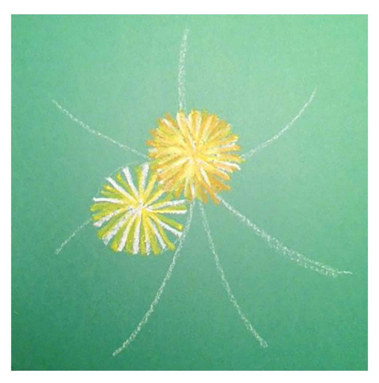
To make the "puff balls", draw bunches of small stars with white pastels. You can lightly trace out a circle shape as a guide.