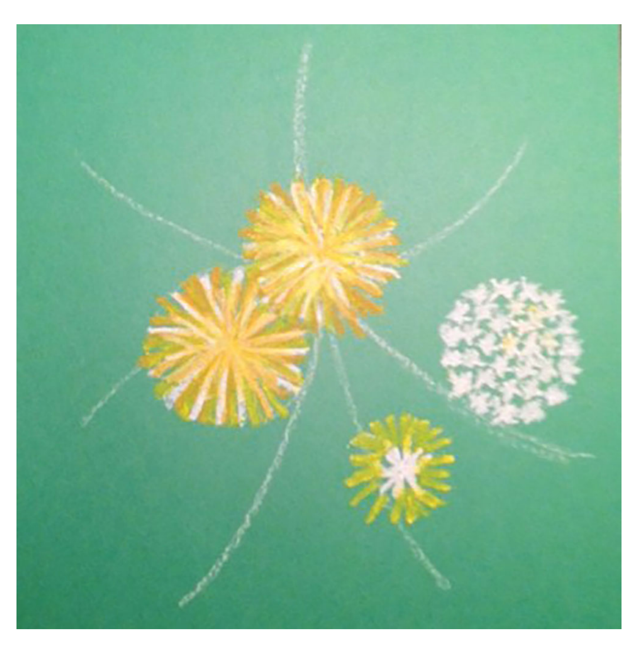
Use the original lines you drew as the leaf stems. Then, using light green, add the leaf shapes coming off of the stems.