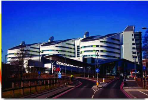
Medical staff at Queen Elizabeth's Hospital cared for Malala after she was shot.