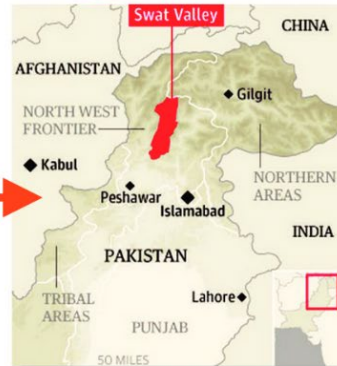
Pakistan was created in 1947 as an independent Muslim nation.

All her life Malala had heard about the conflicts in Pakistan. Ever since the country was created in 1947, wars had taken place there and many leaders had attempted to rule. Malala's favorite, Benazir Bhutto, served as Pakistan's first female prime minister from 1988 to 1990. She served a second term from 1993 to 1996. "She symbolized the end of dictatorship and the beginning of democracy," Malala wrote in her book, I Am Malala . 3