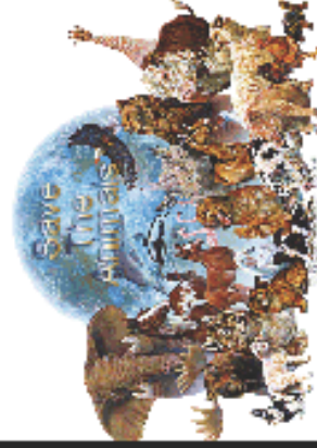
Save the Animals Donation