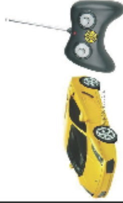
Remote controlled Toy