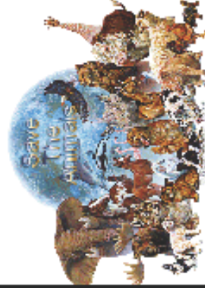
Save the Animals Donation