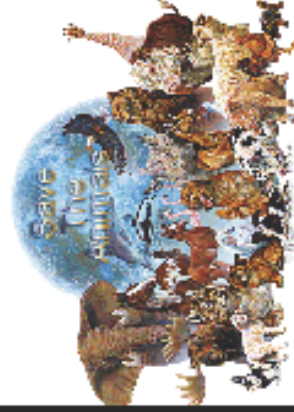
Save the Animals Donation